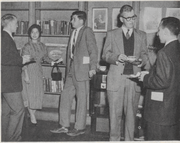
A scene from the student reception in the Law Lounge following the Gregory lecture.