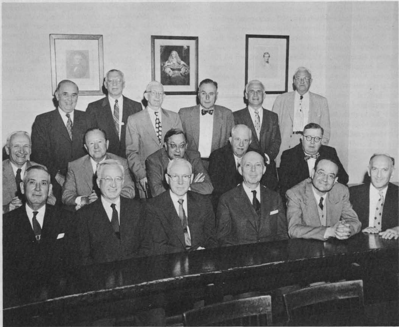
Members of the Class of 1915 gathered in Law South for their 40th Reunion