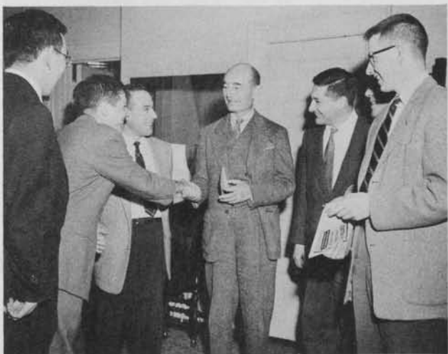
The Honorable Francis Biddle being greeted by students in Beecher Hall prior to his lecture on Mr. Justice Holmes.