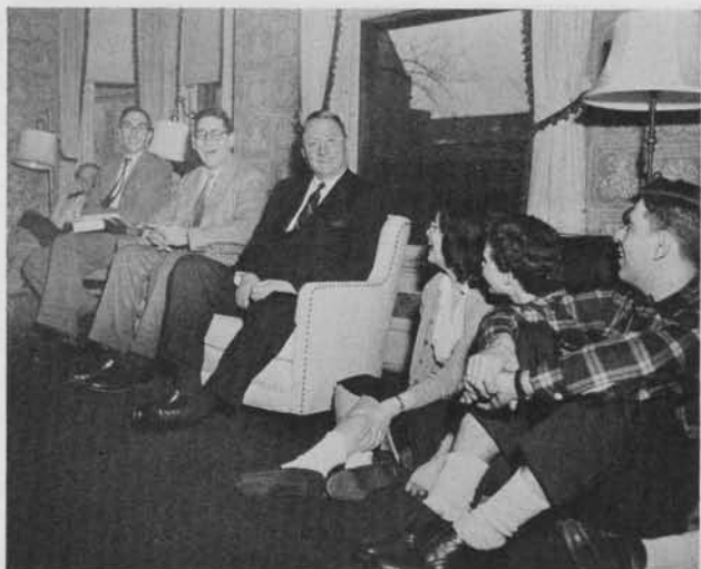
Mr. Justice Douglas, with members of the student body, in the Lounge of The Law School Residence.