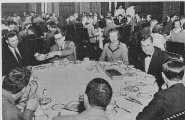
The evening session of the Conference on Jurisprudence in the Quadrangle Club.