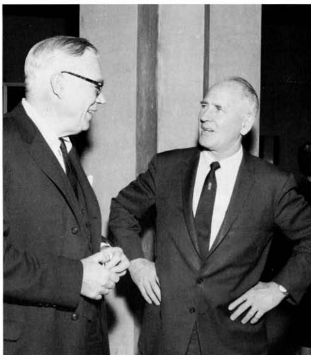
Puzzle: Who is the former President and who is the current President of The University of Chicago?