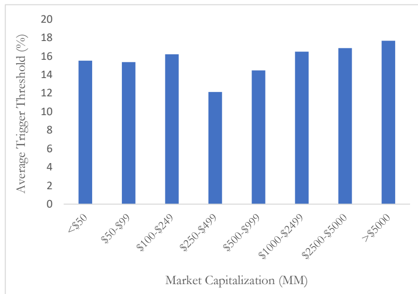
Exhibit 1: Trigger Thresholds for U.S. and Canadian Pills (excludes NOL pills)

When it comes to pills, the ownership threshold required for the pill to be triggered is typically 10–15% for non-passive investors. This threshold rarely discriminates by the size of the company in question. 27 Indeed, there is no inverse correlation between market capitalization and trigger threshold. Exhibit 1 details the trigger thresholds for U.S. and Canadian pills as provided by the RiskMetrics database as of February 2022: