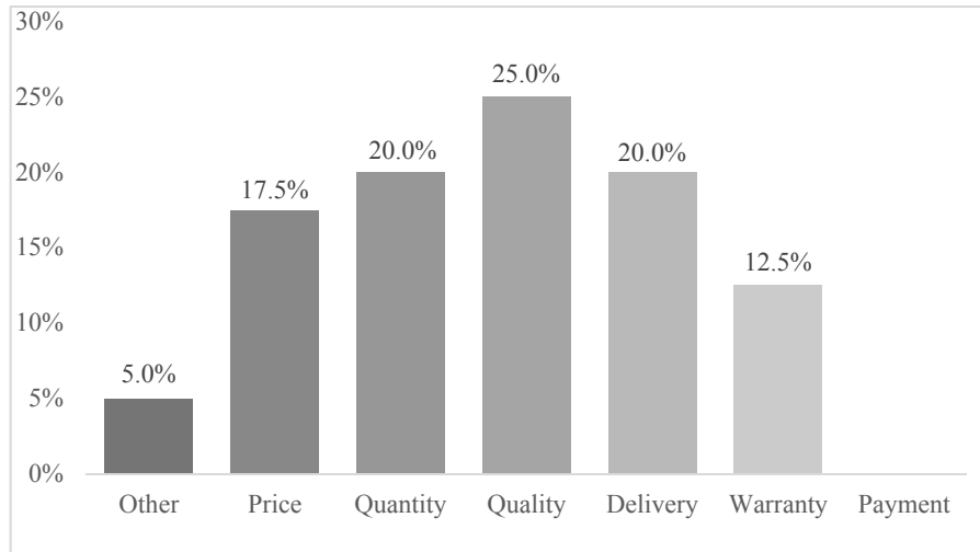
FIGURE 2: SUBJECT MATTER OF THE USAGE ISSUE IN INTERPRETATION CASES

dealt with the core aspects of most deals: price, quantity, quality, delivery, warranty, and payment.